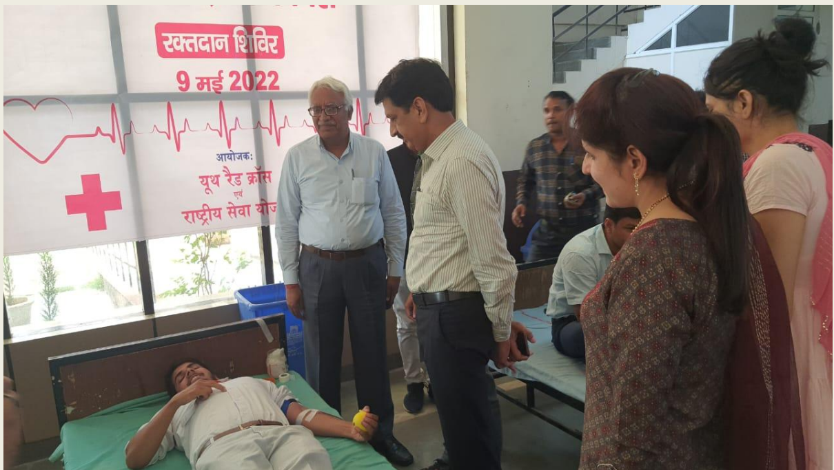
Blood Donation Camp organized by Youth Red Cross of IGU