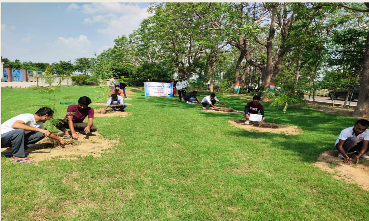
Plantation Drive in the Campus

Indira Gandhi University, Meerpur has started a drive to make the campus green and with this objective, plants of different varieties are planted every year. More than 5000 plants of fruits, herbal and medicinal value etc. are being planted on regular basis.