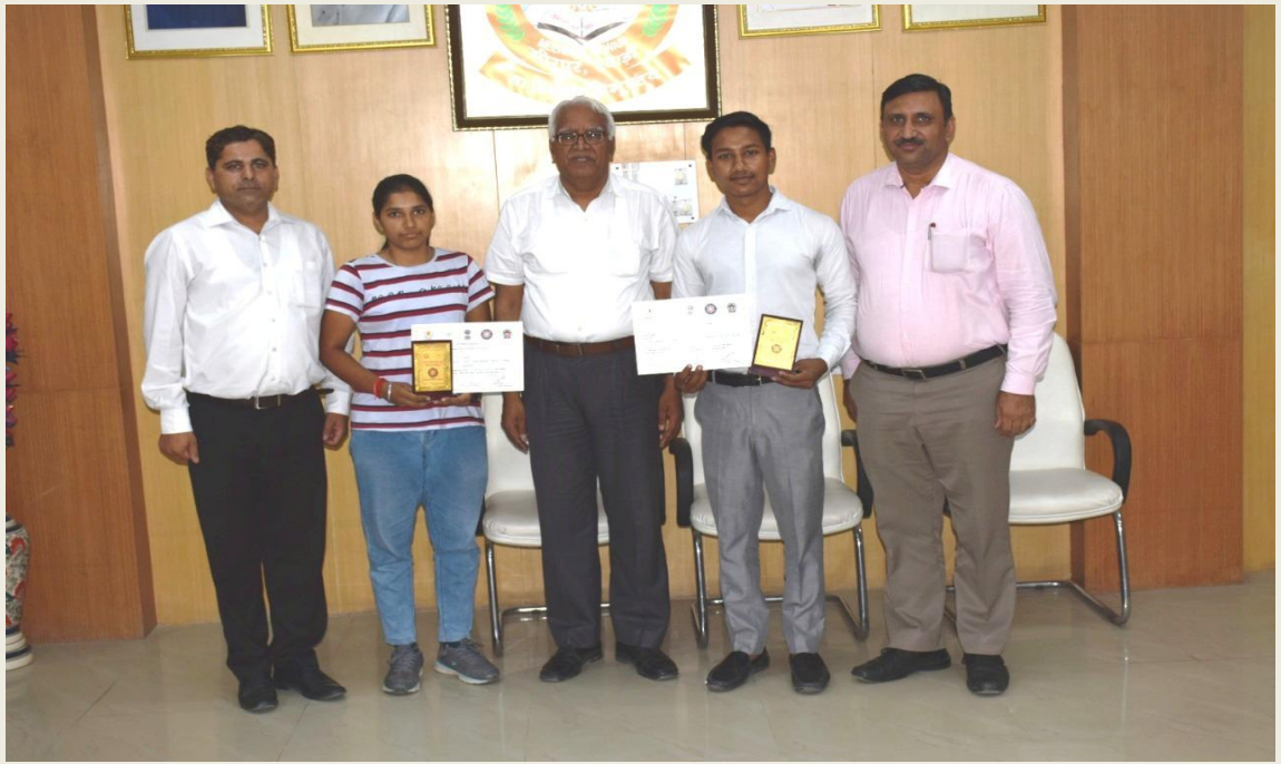
Awards to NSS Volunteers of IGU