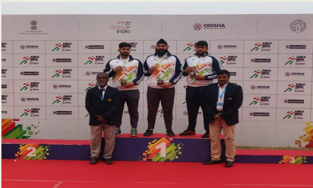
Students of IGU won Bronze medal in Khelo India University Games