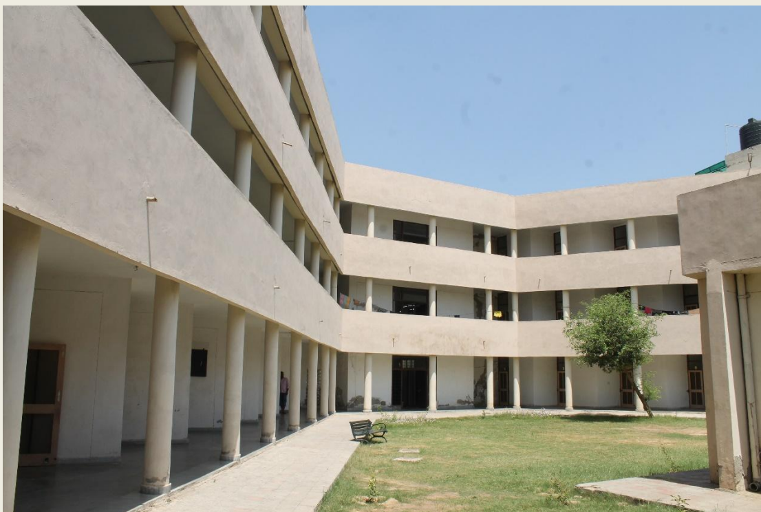
Rani Laxmi Bai Girls Hostel

The university has one Boys Hostel viz. Maharana Pratap Boys Hostel and one Girls Hostel viz Rani Laxmi Bai Girls Hostel. The students may apply for the hostel separately and the Information Brochure for the same is available on the university website www.igu.ac.in .