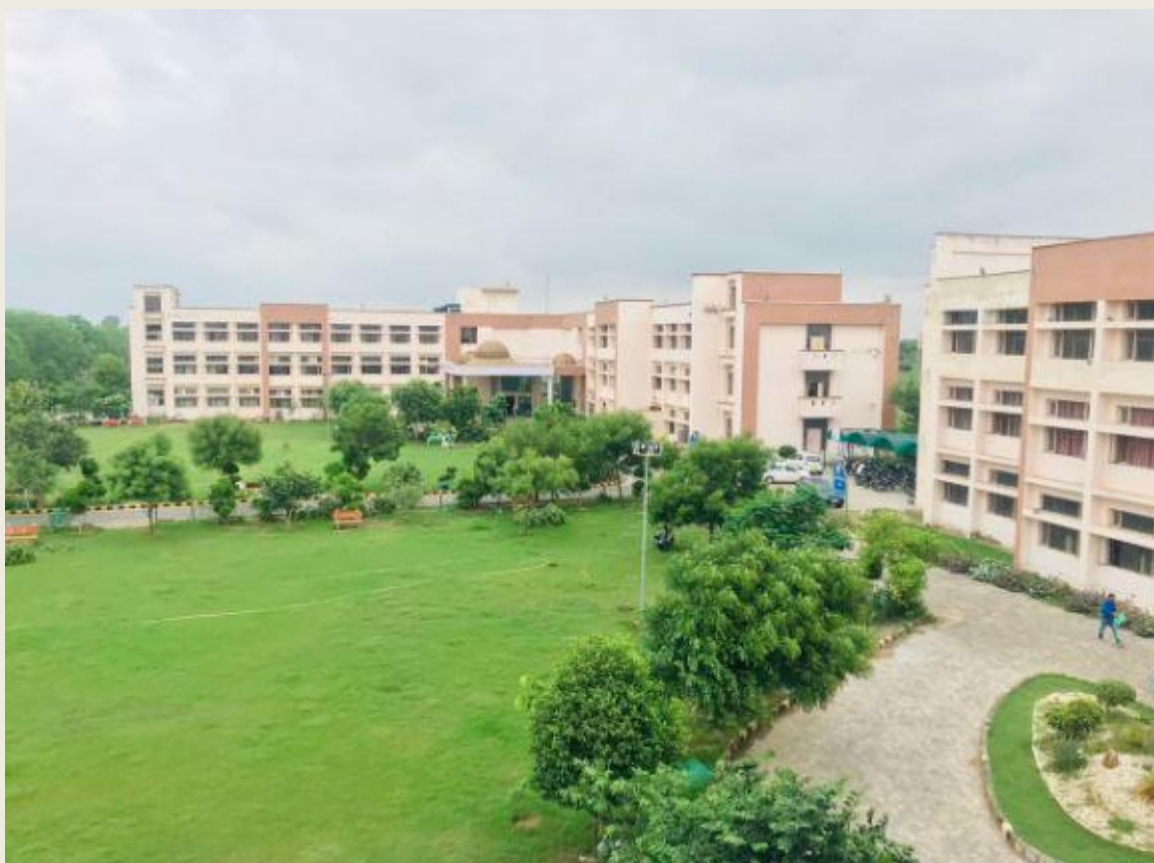
Panoramic view of the Campus

The university is committed to work vigorously for the all-around personality development of students by making them not just outstanding professionals and entrepreneurs but also good individuals with ingrained human values. The university campus is situated in village Meerpur at a distance of 10 km from the district headquarters of Rewari, about 340 km from Chandigarh, the State Capital and 70 km from Indira Gandhi International Airport, New Delhi. It is well connected by railways and roadways as well.